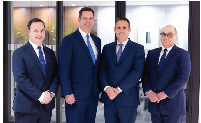
MK Total Wealth Management Group TD Wealth Private Investment Advice